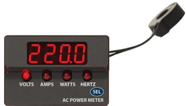
Figure 2A. Multi-function ac power meter

In a perfect world, there would be no need to extend a CT’s lead length. That is, the load conductor whose current one intends to measure would be