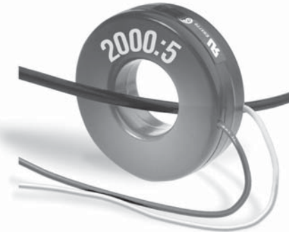
Figure 3. Typical 5 Amp output “donut” CT

IMPORTANT! To ensure safe and reliable operation, “donut style” 5 Amp output current transformers and all associated equipment must be installed and serviced by qualified technical personnel. Never open the CT’s secondary connections while the primary circuit is energized. Open CT secondary wiring can generate potentially lethal voltages when the primary circuit is energized. Contact Murata Power Solutions if you have any doubts regarding the installation or operation of any of our ac-mains measurement instruments and accessory CTs.