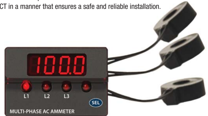
Figure 2B. 3-phase ac ammeter

located in the immediate vicinity of meter. However, in many applications, the ammeter or power meter must be located a significant distance from the load conductor. The purpose of this application note is to provide qualified technical personnel the information needed to add lead extensions to a CT in a manner that ensures a safe and reliable installation.