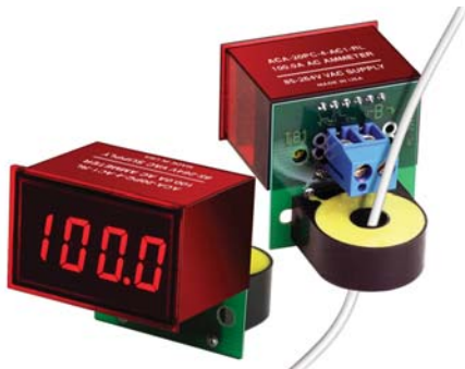
Figure 1A. ac ammeter with built-in CT

An example of ac ammeters with a built-in CT are our ACA-20PC series ammeters shown in Figure 1A. This series has the CT soldered directly to the ammeter’s pc-board, or in some models by wire leads. In contrast, our ACA5-20PC series ammeters accept the output of external 5 Amp donut CTs; an example is shown in Figure 1B. Our ACM20 multifunction ac power meters and ACM3P 3-phase ammeters shown in Figures 2A and 2B are all supplied with built-in CTs that have wire lead lengths typically under six inches (15cm).