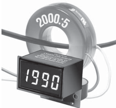
Figure 1B. ac ammeter for external 5 Amp CTs

It’s important to note that lead extensions must not be added to our ac meters that have built-in, pc-board style CTs (i.e., those with no wire leads). These CTs are soldered in place, and removing them could damage the pc-board and/or the CT itself, as well as producing an electrically unsafe and unreliable installation. Also, please keep in mind, modifying our meters will void their warranty and, if applicable, their safety agency rating.